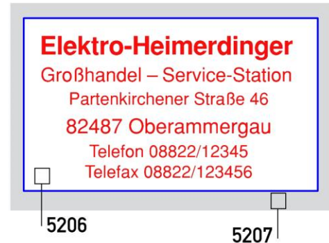
Frame on larger stamp model

You can use a larger stamp model. The frame covers the largest possible textplate and you can dispense a pad of 8 mm width.