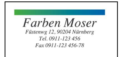
Ψ Colour gradient

Thus, all setting patterns must be designed with clearly separated colour areas. The system cannot process any polished contours. Please consider this when saving / exporting from your individual setting program!