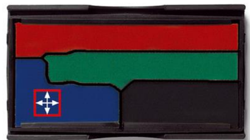
Minimum size of a colour field on the pad