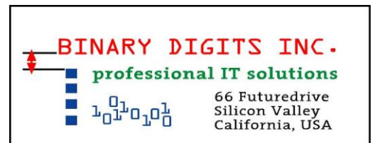
Minimum distance on the impression