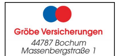
Ψ Colliding colours

Thus, even the finest outlines cannot be processed. Do not use outline / hairline settings!